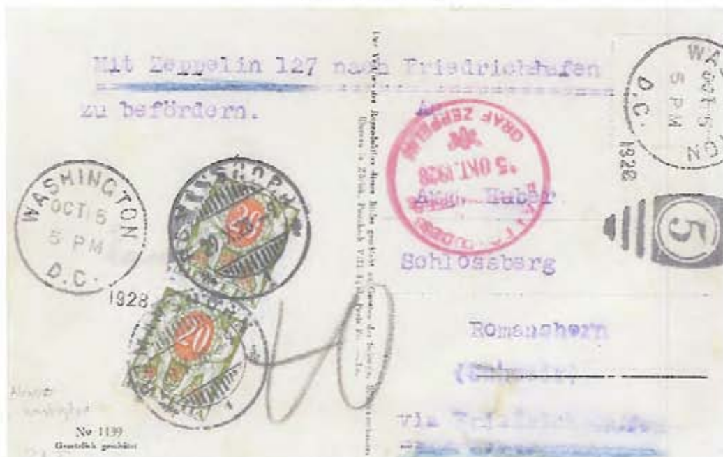
Postcard dropped over Washington, D.C., and then forwarded by regular means to Switzerland, where it was taxed postage due.

In October of 1928, less than a month after its first test flight, the German LZ127 Graf Zeppelin flew round trip from Friedrichshafen, Germany, to Lakehurst, New Jersey, to demonstrate the feasibility and practicality of commercial transatlantic service. The round trip not only set a distance record but it was the first transatlantic dirigible flight operated as a passenger carrier for profit, the first flight for which a government had issued official zeppelin stamps, and the first westbound flight over the Atlantic Ocean with a woman onboard, journalist Lady Drummond Hay. This dramatic flight received considerable press coverage during the harrowing time crew members repaired a damaged stabilizer fin while in flight.