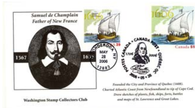
A cover with 2 stamps is $6.00.