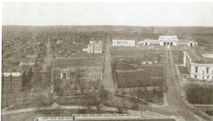
VIEW FROM CAPITOL LOOKING NORTH, ABOUT 1915, SHOWING MALTRY BUILDING AT LEFT, TRUCK NO. 1 ON NORTH CAPITOL STREET, SENATE STABLES AND NO. 3 ENGINE HOUSE ON DELAWARE AVENUE, AND SENATE OFFICE BUILDING AT RIGHT

The letter enclosed is address to Senator Henry W. Keyes who had just been elected to the Senate in 1918 and was a member of the Senate Committee on Expenditures in the Post Office Department. In subsequent Congress he became Chairman of this committee. Although the letter is dated 5 December 1919, the envelope was back stamped “WASHINGTON, D.C., DEC 5, 12 M, 1919”. Which means the letter was written before December 5 th . This is not the only problem with the letter. The letter says the mail landed about 100 feet from the Capitol implying it landed on the East Plaza of the Capitol. According to contemporary newspaper accounts it did not quite happen that way. According to the The Evening Star the landing zone was the vacant block just south of the Washington City Post Office, now the National Postal Museum. With the construction of Union Station and the removal of the railroad stations from the National Mall, Congress expanded the Capitol Ground to connect the Capitol with the new entrance to the city, a project that took from 1910 to 1940 to complete. But by 1915 most of the land had been acquired and cleared, as seen in the picture below. According to the Star article, the landing site was missed substantially.