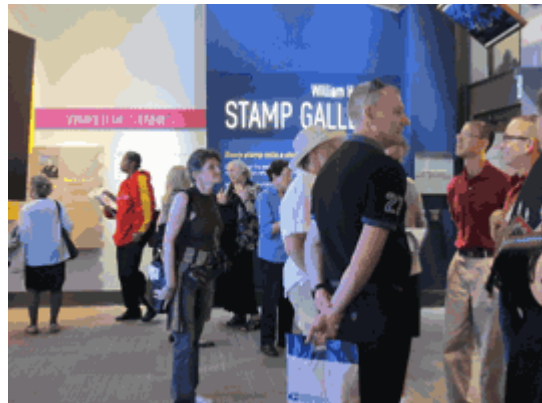
Gross Stamp Gallery Opening Day September 22, 2013