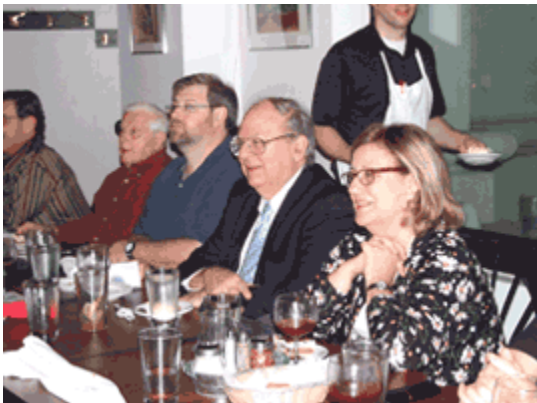
Annual Club Awards Dinner October 2, 2013